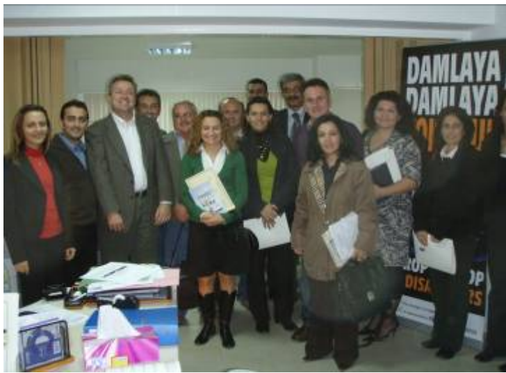
Picture of the participants and the trainers, highlighting the completion of the first “Introduction to ArcGIS I” training organized by SAVE in December, 2007.